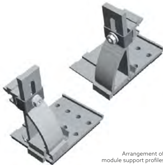
Arrangement of module support profiles