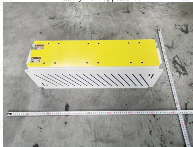
Battery front appearance